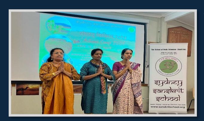
International Year of Camelids by the United Nations presented by Sydney Sanskrit School

The United Nations has designated 2024 as the International Year of Camelids. The Sydney Sanskrit School organised a camp in Sanskrit on its theme of the desert. Director SVCC was invited for the inaugural session. The event provides a great opportunity for young students to learn and discover life in the desert through Sanskrit poetry and prose. Students and parents gathered at Glenfield Scout Centre, dressed in warm clothes and filled with excitement to explore the world of deserts.