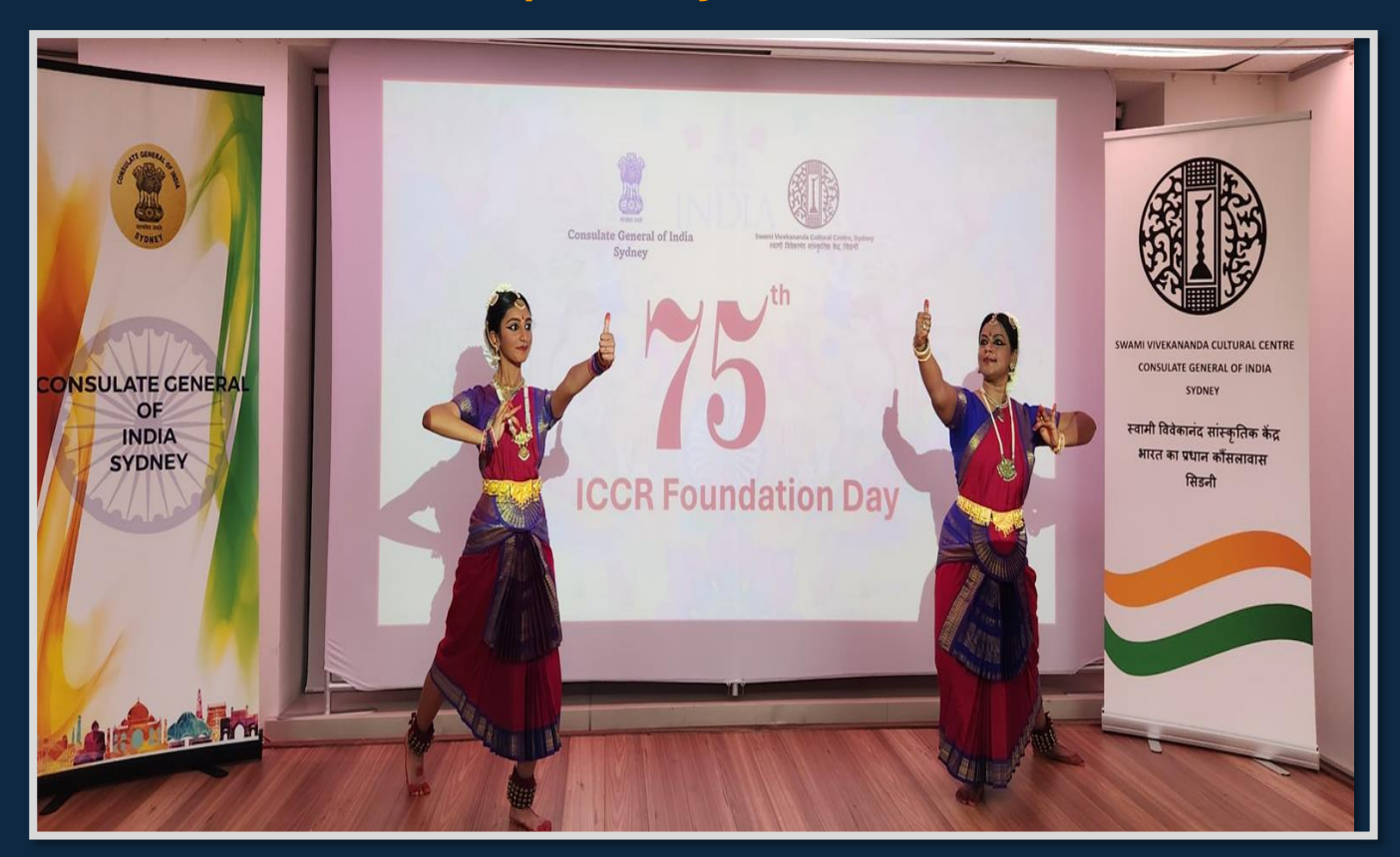
Celebrations of 75<sup>th</sup> ICCR Foundation Day at SVCC Sydney