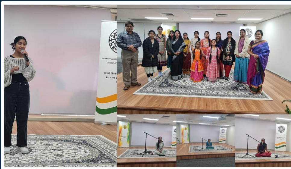
Indian classical vocal performances (Hindustani and Carnatic)

Indian classical vocal performances (Hindustani and Carnatic) were the concluding element of the 'Talent Show of Indian Performing Arts'.