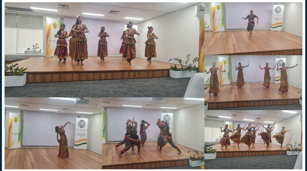
Indian Folk Dance Performances