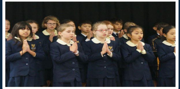
Sanskrit Recitation Competition by John Colet School

2024 Sanskrit Recitation Competition was held by John Colet School. The competition includes verses and chapters from Gita. Director SVCC was present as the guest of honour.