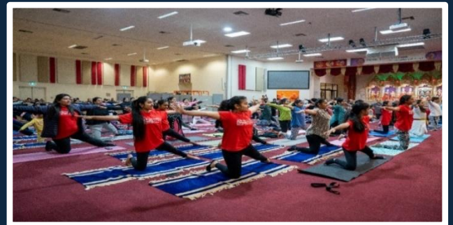
IDY in Adelaide at BAPS Shri Swaminarayan Mandir

Vibrant celebration of the International Day of Yoga were held at the BAPS Shri Swaminarayan Mandir in Adelaide. The event was a collaborative effort between the Consulate General of India and the Swami Vivekananda Cultural Centre, Sydney and BAPS Adelaide.