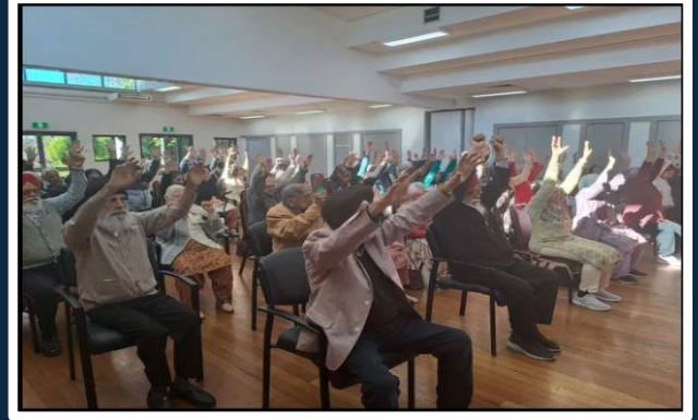
Yoga for Seniors