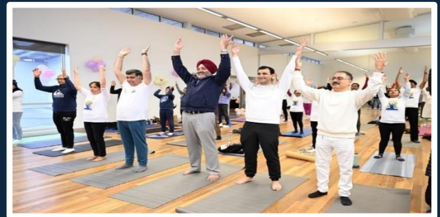
International Day of Yoga at The Ponds