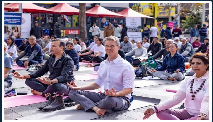
Parramatta Square – IDY celebrations