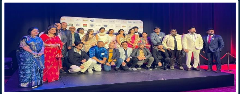
International Gujarati Film festival

The Head of Chancery and Director SVCC was invited as the guest of honour for the International Gujarati Film Festival organised by Cloud 9 Creations Events and Entertainment at the Sydney Opera House. The 'Chhello Show', a Gujarati film was India's official entry to the Oscars 2023 was shown at its opening.